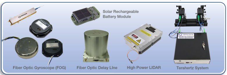
BROADBAND: Defense & Homeland Security

• Video Transport Products - Our video transport product line offers solutions for broadcasting, transportation, IP television (IPTV), mobile video, and security and surveillance applications over private and public networks. Our video, audio, data, and RF transmission systems serve both analog and digital requirements, providing cost-effective, flexible solutions geared for network reconstruction and expansion.