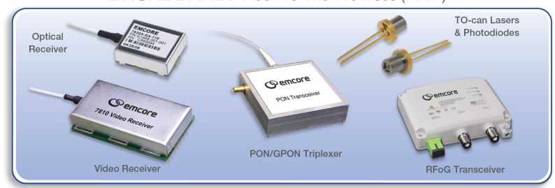
BROADBAND: Fiber-To-The-Premises (FTTP)

• Fiber-To-The-Premises (FTTP) Products - Telecommunications companies are increasingly extending their optical infrastructure to their customers' location in order to deliver higher bandwidth services. We have developed customer qualified FTTP components and subsystem products to support plans by telephone companies to offer voice, video, and data services through the deployment of new fiber optics-based access networks. Our FTTP products include passive optical network (PON) transceivers, radio frequency over glass (RFoG) optical transceivers, analog fiber optic transmitters for video overlay and high-power erbium-doped fiber amplifiers (EDFA), analog and digital lasers, photodetectors and subassembly components, analog video receivers, and multi-dwelling unit (MDU) video receivers. Our products provide our customers with higher performance for analog and digital characteristics, integrated infrastructure to support competitive costs, and additional support for multiple standards.