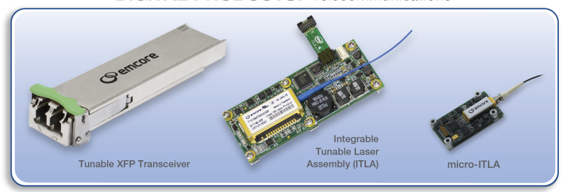
DIGITAL PRODUCTS: Telecommunications

• Telecom Optical Products - We believe that we are a leading supplier for tunable 10, 40, and 100 gigabits per second (Gb/s) transmission applications for dense wavelength division multiplexed (DWDM) transponders and transceivers for telecommunications transport systems. We are one of few suppliers who offer vertically-integrated products, including external-cavity laser modules, integrated tunable laser assemblies (ITLAs), micro integrable tunable laser assemblies (μITLA), 300-pin transponders, and tunable 10 gigabits small form factor pluggable (TXFP) transceivers. Our internally developed laser technology is highly suited for applications of 10, 40, and 100 Gb/s due to its superior narrow linewidth and low noise characteristics. Many of our DWDM products are fully Telcordia® qualified and comply with industry multi-source agreements (MSAs).