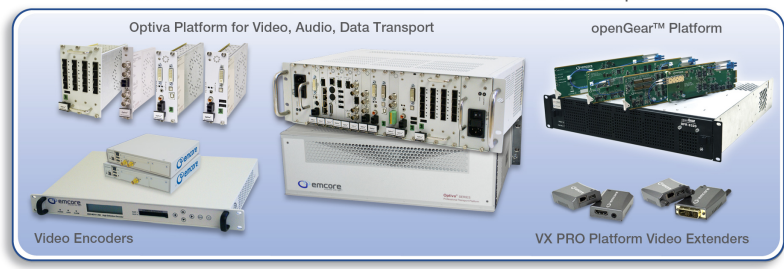
BROADBAND: Broadcast & Pro A/V Video Transport

• Video Transport Products - Our video transport product line offers solutions for broadcasting, transportation, IP television (IPTV), mobile video, and security and surveillance applications over private and public networks. Our video, audio, data, and RF transmission systems serve both analog and digital requirements, providing cost-effective, flexible solutions geared for network reconstruction and expansion.